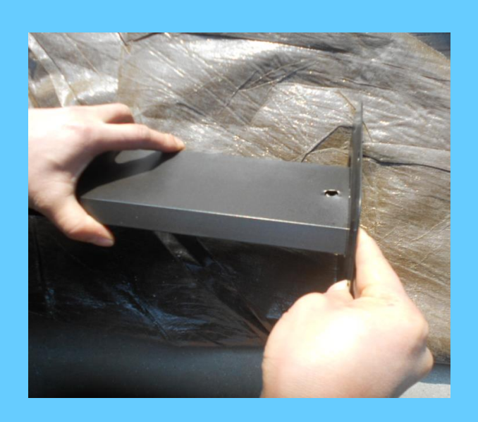
Assemble the plate to the posts, fix all the 4 plates on the posts