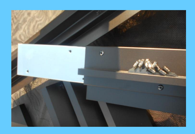
Open the box, take out all the parts, put the hooks on each beams